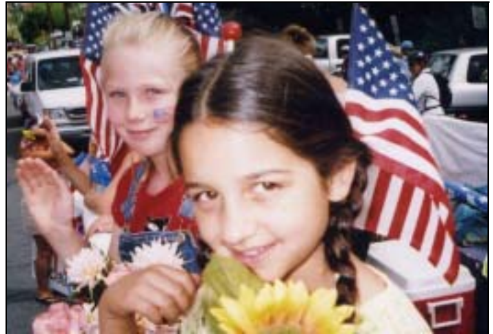
July Fourth Float — Story & pictures page 3.

Recycle Utah will hold a Green Building Seminar on Friday, Nov. 19th at Deer Valley Resort . This is not about straw bale building or adobe huts. This seminar is how you can build and decorate with green products in your home. The seminar will be offered in conjunction with the Park City Home Builders Association and the Sustainable Community Group, a task force under the auspices of Park City Municipal. See the related article on page 6.